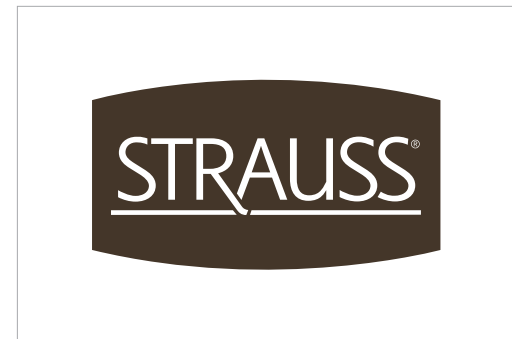
← Black and White →