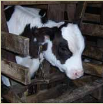
Old Way: Tethered and Crated calf