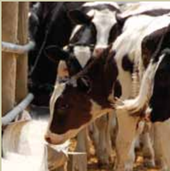
Strauss Group Raised Alternative